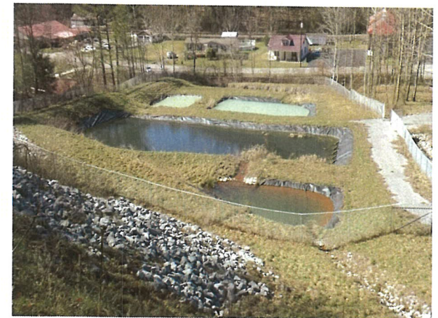
Penhook AMD Treatment System

Daniel Boone Soil & Water Conservation District 32637 Main Street Jonesville, VA 24263