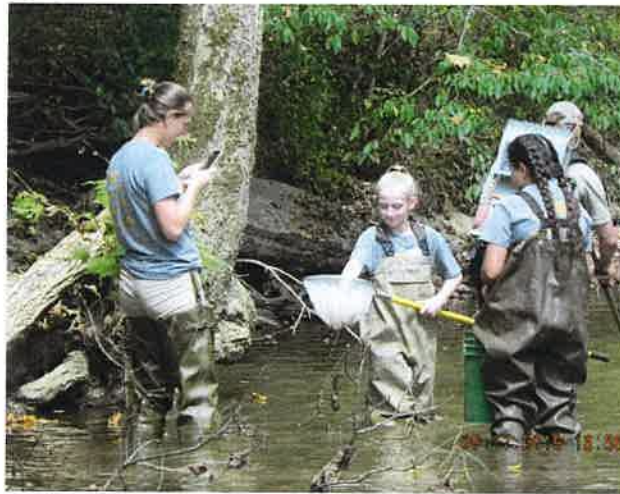
Kids in the Creek Day